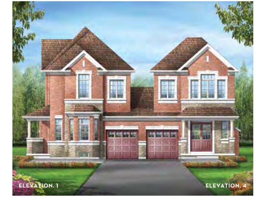
NEWBERRY 12 • ELEVATION 1