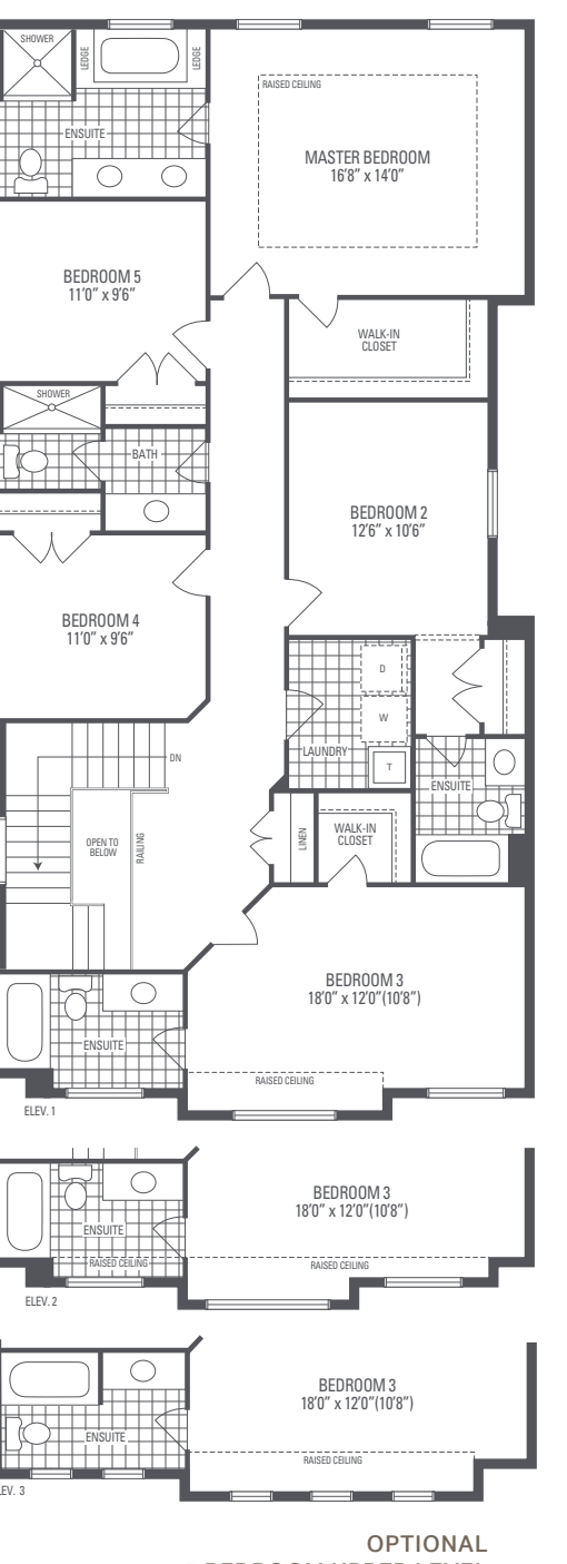
5 BEDROOM UPPER LEVEL